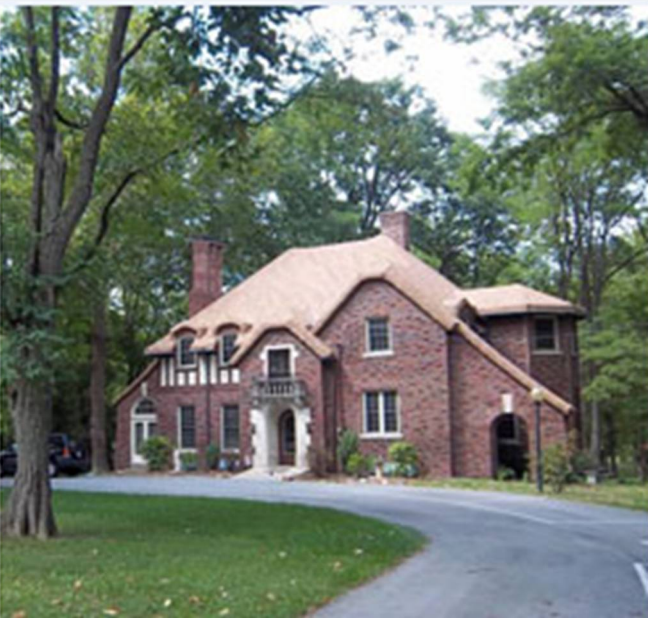
The Hermitage 3650 East 46 th Street Indianapolis, IN 46205

(Please reserve your seat by Sept. 28 th )